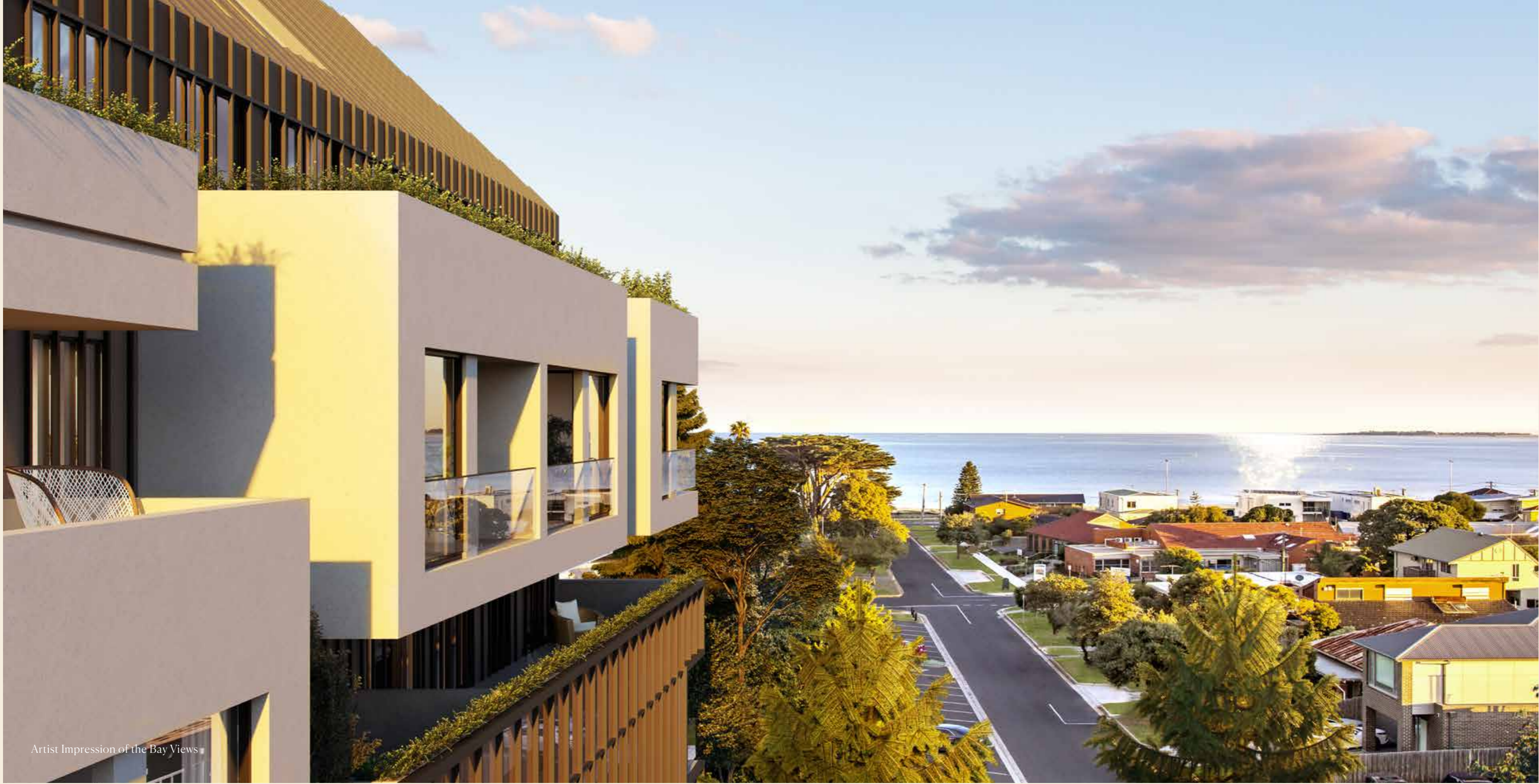
Artist Impression of the Bay Views