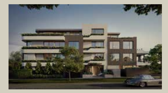
Adelle by Jellis Craig Projects